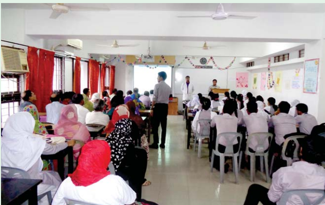
Guardian meeting after the publication of the result of internal exam

Views exchanging meetings among students, guardians and teachers are held on a date fixed by college/departmental authority or after the exams. It is a must for the guardians to be present there. Infact an examinee's progress in study or overall development depends on the united efforts of the students, teachers and guardians. In this way the students can make good results.