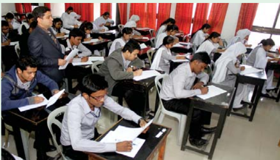
Students of BBA program are in the Exam Hall

The college has no students' council. But there is a students' welfare council under the supervision