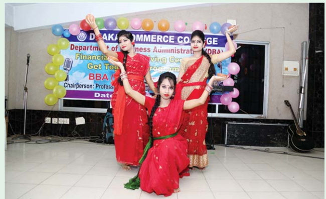
Dance being performed by the BBA students

with the prior permission of the authority. Such permission is given in case of emergency.