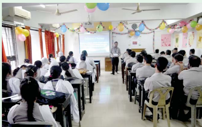
Presentation Program of the students of BBA

No student can stay in the veranda, field, cafeteria, canteen or library while the classes are