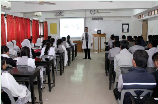
Students of BBA program are enjoying a class