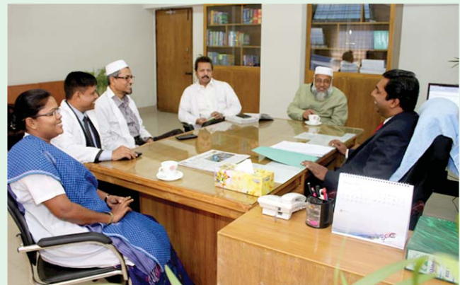
Conducting departmental meeting

After collecting papers from accounts section of the college, semester tuition fees and other fees should be deposited in the collection centre of Social Islami Bank Ltd. at college premises on fixed date and time. Receipts of paying fees must be shown to the office of the college.