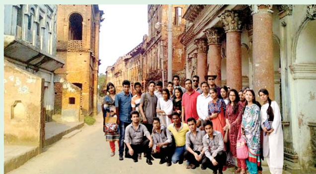
Students of BBA visit to the historical 'Panam City'