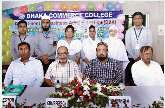
Six Financial Waiver receivers are with the Principal, Vice Principal, Administration (In-charge), Advisor (Academic) and Director of the BBA Program