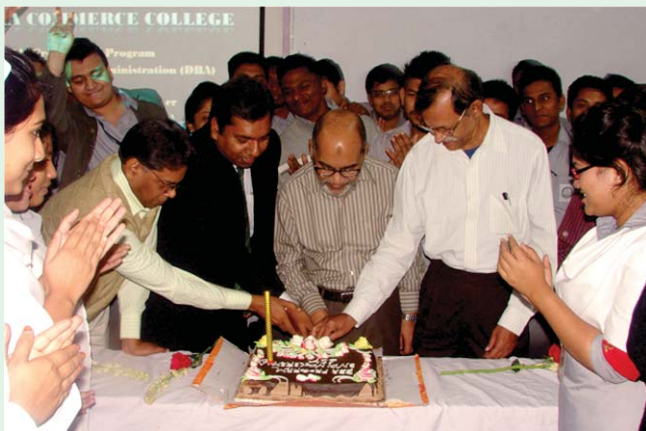
Principal, Advisor (Academic), Director, Faculty and Students in 'Class Ending Celebration Program' of BBA