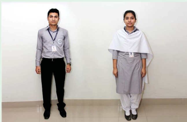
Students in BBA uniform

All Students should wear the dress and badge determined by the college. Without uniform and after schedule time no student is allowed to enter the college.