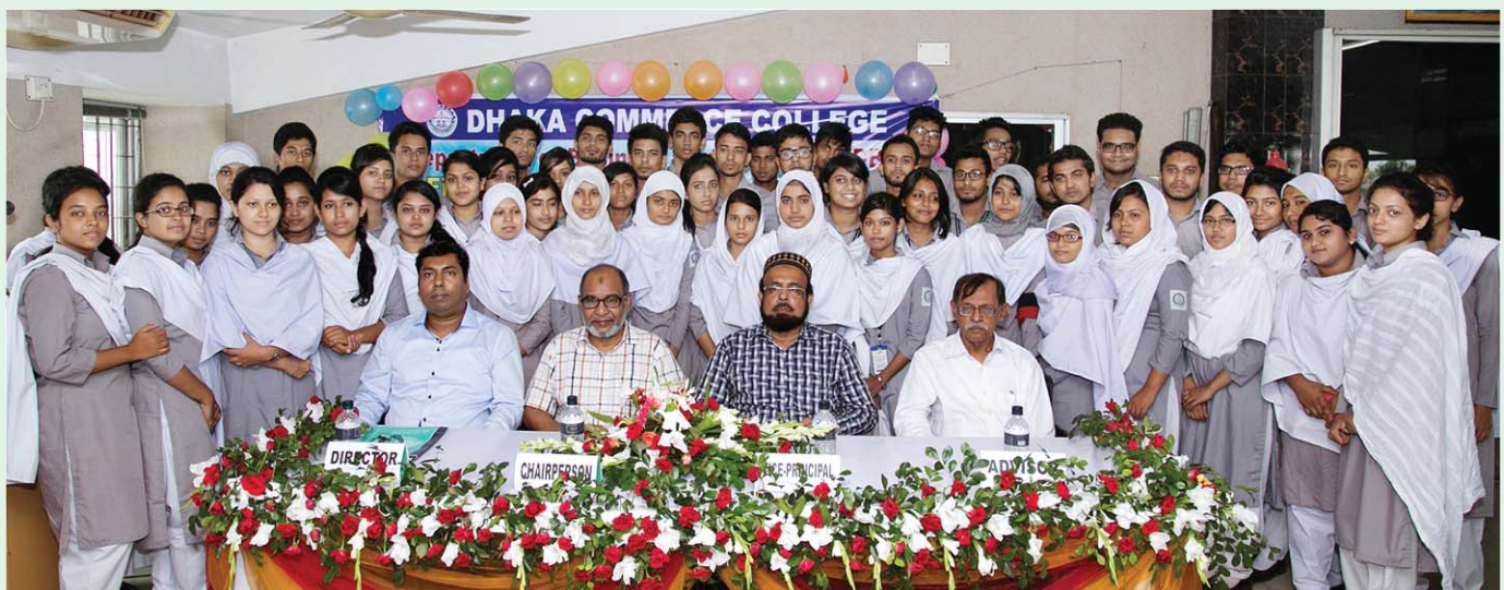
Students of BBA 7 th Batch are with the Principal, Vice Principal, Administration (In-charge), Advisor (Academic) and Director of the BBA Program