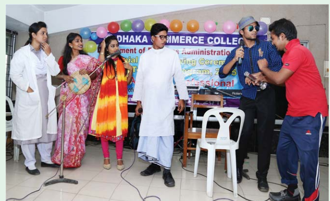
Drama staged by the BBA students

We will build you up as a well-educated and self-educated person through discipline, and diligence which will take you to the zenith of success in every sphere of your future life. Our