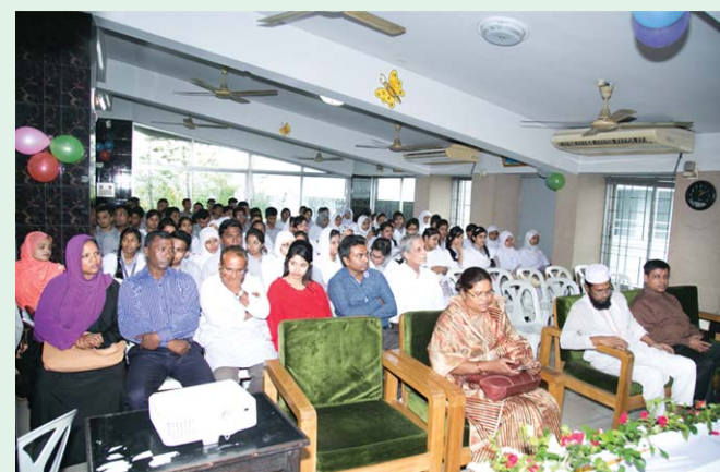
Audience of Financial Waiver and Get-Together Program