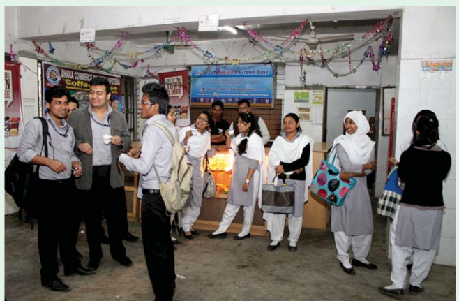
Students are in the Cafeteria in a holiday mood