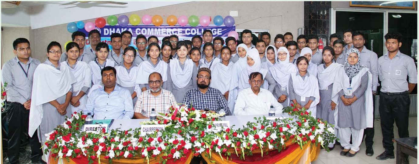
Students of BBA 6 th Batch are with the Principal, Vice Principal, Administration (In-charge), Advisor (Academic) and Director of the BBA Program