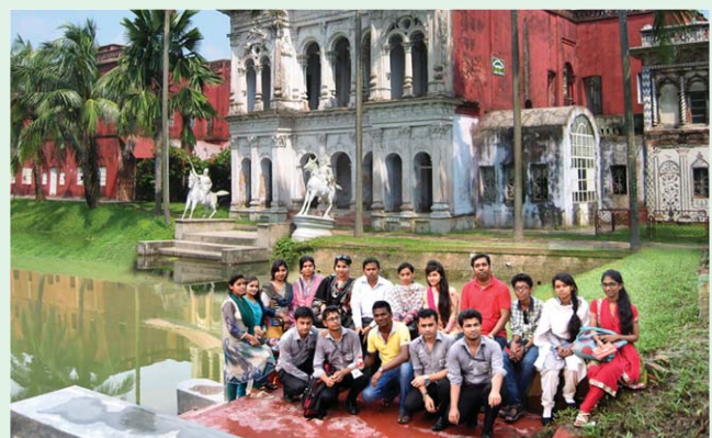
BBA Students visit to the historical city of Sonargaon

The academic and administrative matters of the students of the program are looked after by the