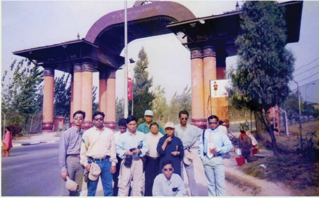
SAARC Tour of the college: In front of Tri Bhubon Intl. Airport, Nepal