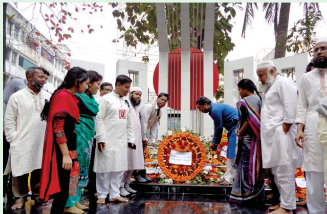
The faculty and the students of BBA program showing tribute to the martyrs of the Language Movement