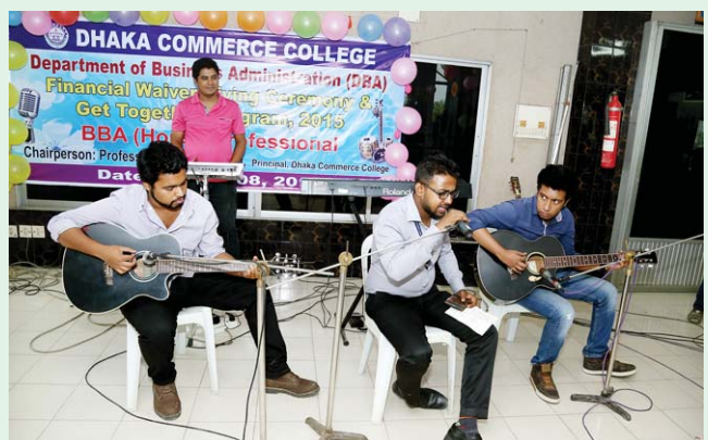
Audience being enthralled by the music of BBA student

Maximum five days leave of absence in each semester for a student may be granted under special circumstances for the application of the real/original guardian. However, such leave may not be granted in case of examination.