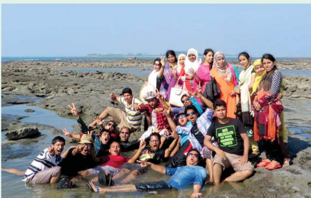
Study Tour of the college at Chera Dip in Saint Martin Island