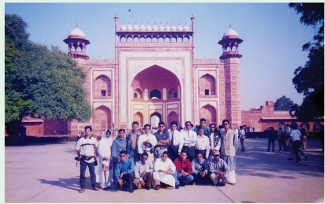
SAARC Tour of the college: At the front gate of the Taj Mahal, India

Any indecorous activity subversive of students is strictly prohibited while in uniform. Anybody involved in such activity must be turned out of the college on discipline ground.