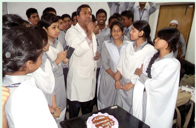
Celebrating presentation program by the BBA students