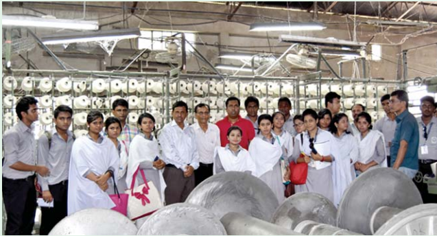
BBA students and faculty members with the General Manager inside Asian Textile Mills Ltd.