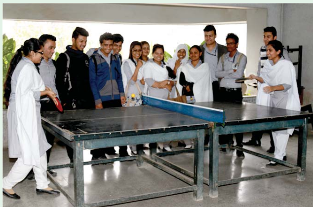
Students of BBA program are passing their pleasant time playing Table Tennis

Guardians (only ID card holders) are allowed to meet with the students during class hours only